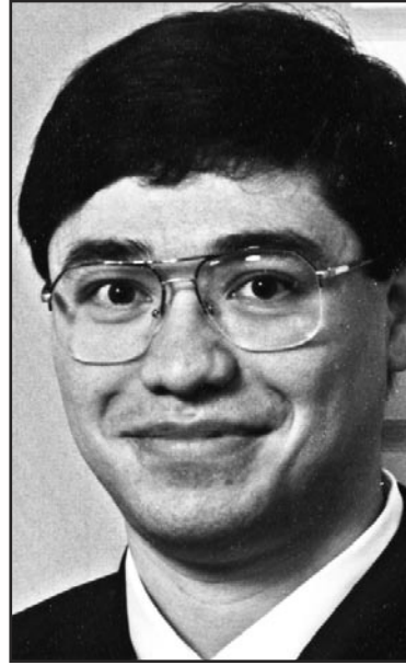
Zitola Worcester & Middlesex

Visit the campaign's website at www.jill4rep.org .