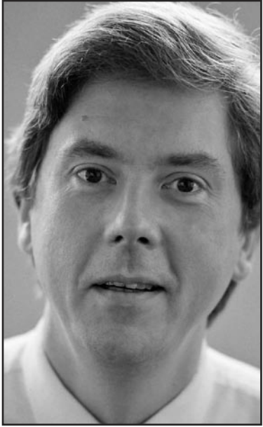
Fortune 1st Franklin